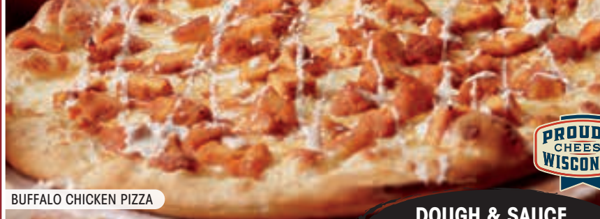
BUFFALO CHICKEN PIZZA