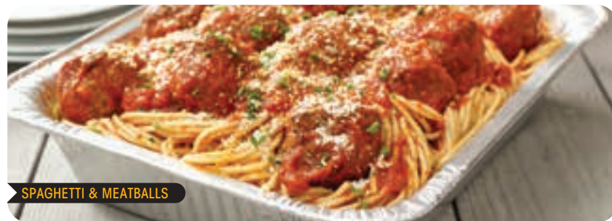
SPAGHETTI & MEATBALLS

Catering orders served with fresh homebaked bread