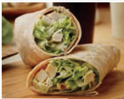
CHICKEN CAESAR WRAP

VEGGIE WRAP Asparagus, eggplant, zucchini, carrots, portobello mushrooms & roasted red peppers