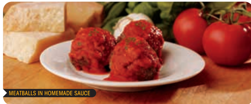
MEATBALLS IN HOMEMADE SAUCE